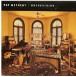
Pat Metheny Orchestrion Nonesuch Records

The normally forward reaching Metheny looked back in time for the inspiration for his latest project, that is essentially a solo record with a difference. The Orchestrion is a mechanical multi-instrument where the instruments, including a host of percussion, are played using technology of solenoid switches and pneumatics! Despite its mechanical delivery, the music sounds anything but mechanical. Metheny's guitar soars over his 'orchestral' compositions that are in no way compromised by their mode of execution. BK