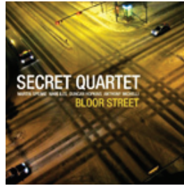
Secret Quartet Bloor Street Edition Records